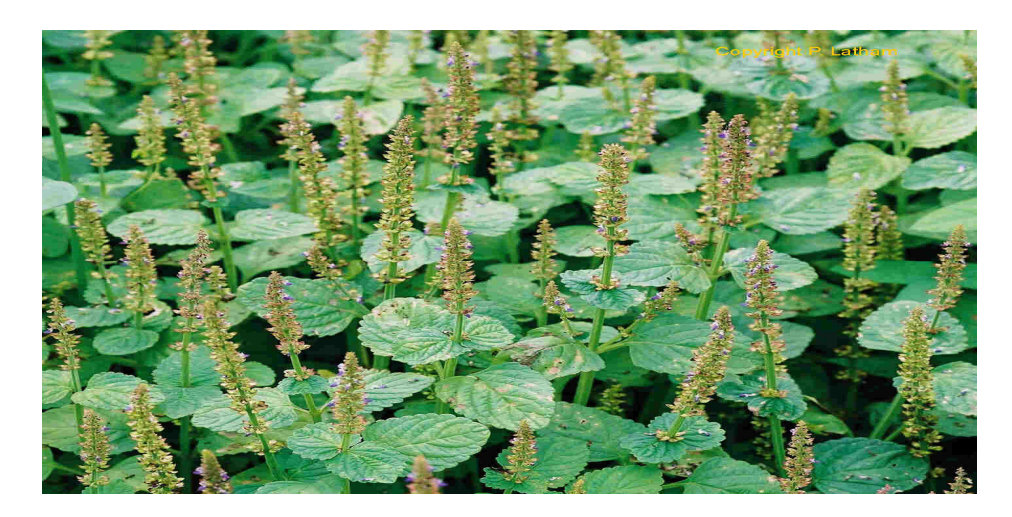
Fig. 1: Solenostemon monostachyus in its natural habitat

CTO-20AC column oven, a CBM-20Alite system controller and Shimadzu's Windows LC solution software (Shimadzu Corporation, Kyoto, Japan). A VP-ODS column with dimensions of 150 \times 4.6 mm and a particle size of 5 \mu m was employed.